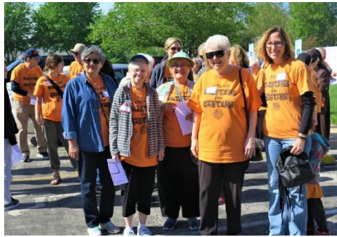
posed at the Finish Line . . .