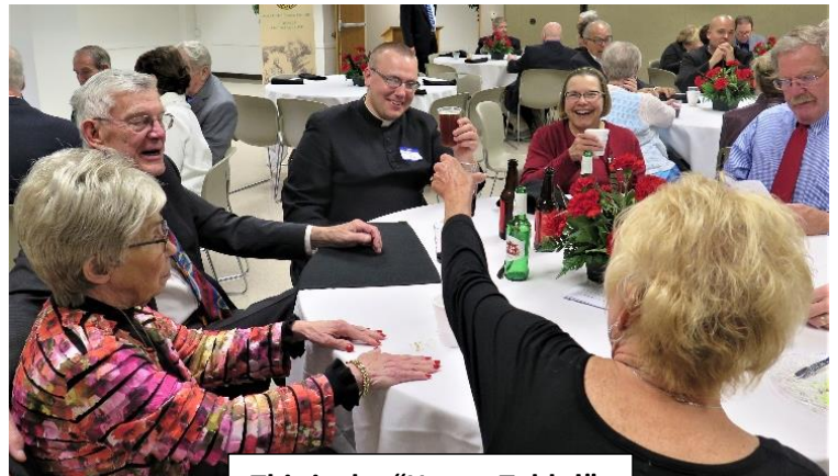
This is the "Happy Table!"