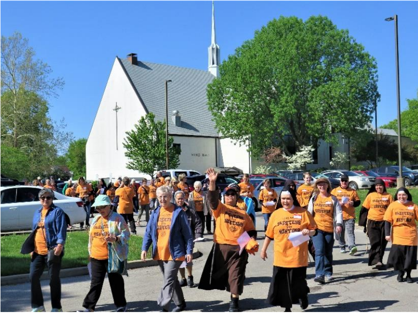
We began the walk at St. Thomas More Church.