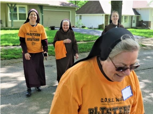
Wandered through the streets. . .