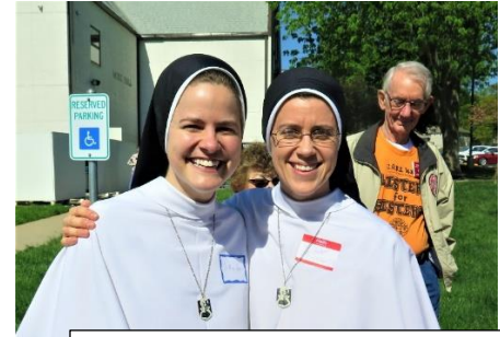
These Sisters are ready to walk!